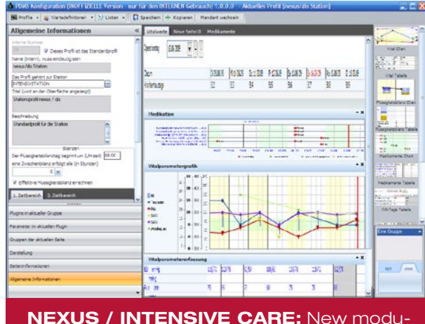
le embedded to NEXUS /HIS.

Consideration of monitoring data and entry of additional parameters is in a uniform chart. It is the central module of NEXUS / INTENSIVE CARE and at the same time is the central work interface of the nursing solution in NEXUS / HIS. In addition to monitoring data, the patient chart displays all vital parameters, levels of liquids and the medication situation of the patient. As